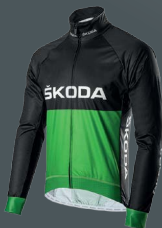
Men's Jacket €65