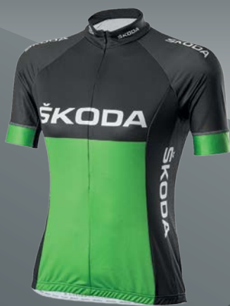
Women's Jersey €35