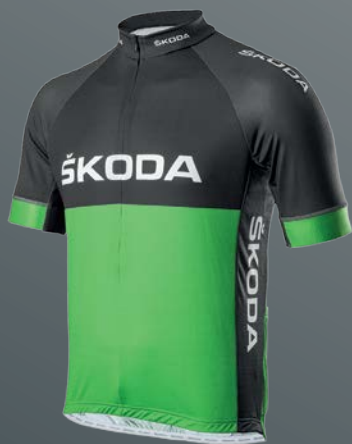
Men's Jersey €35