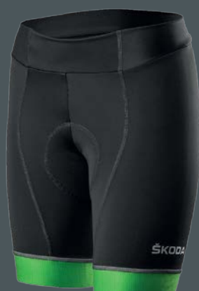
Women's Shorts €40