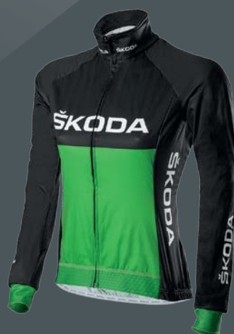
Women's Jacket €65