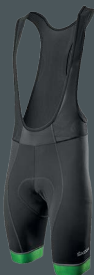
Men's Bibshorts €45